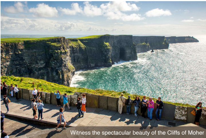
Witness the spectacular beauty of the Cliffs of Moher