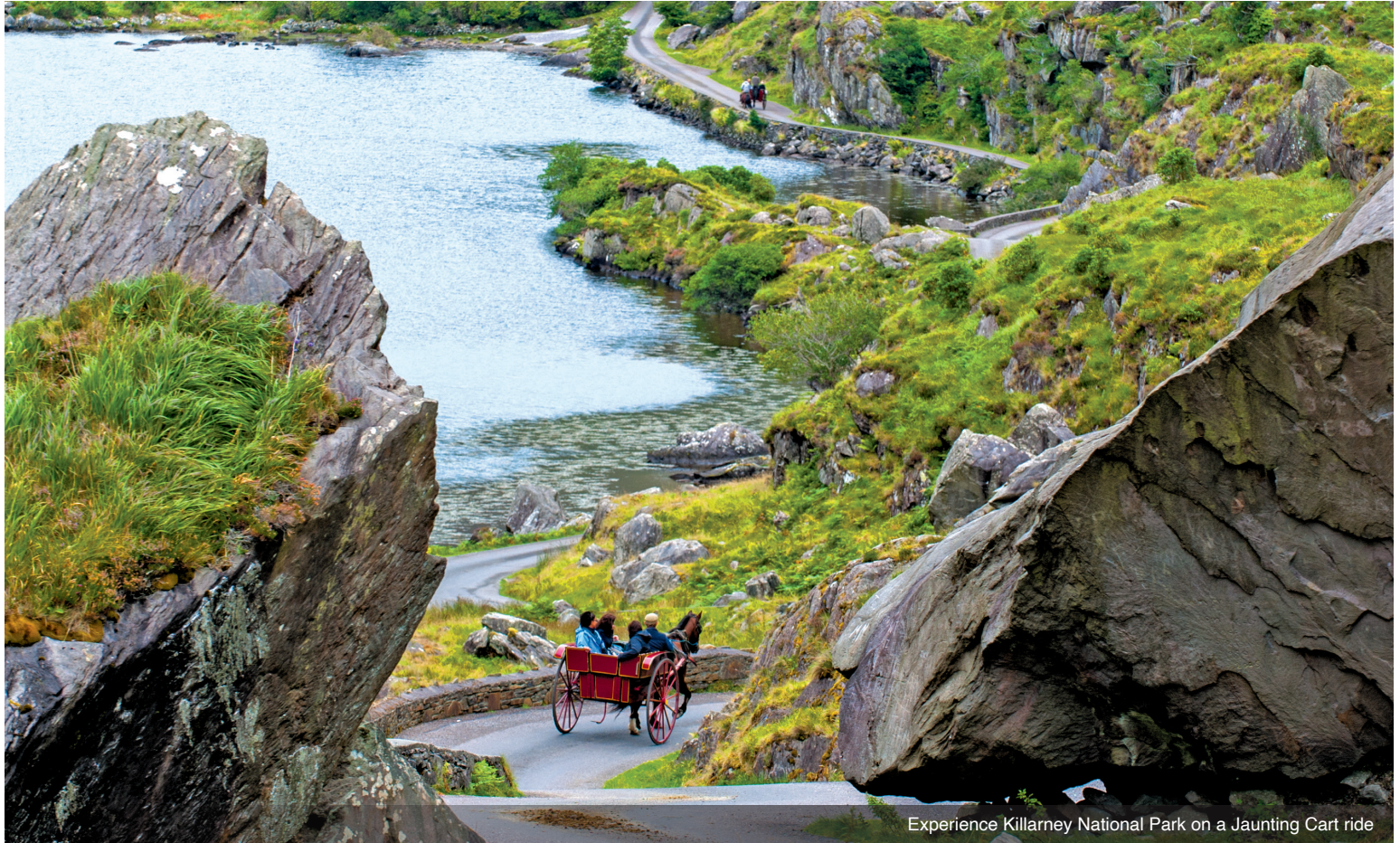
Experience Killarney National Park on a Jaunting Cart ride